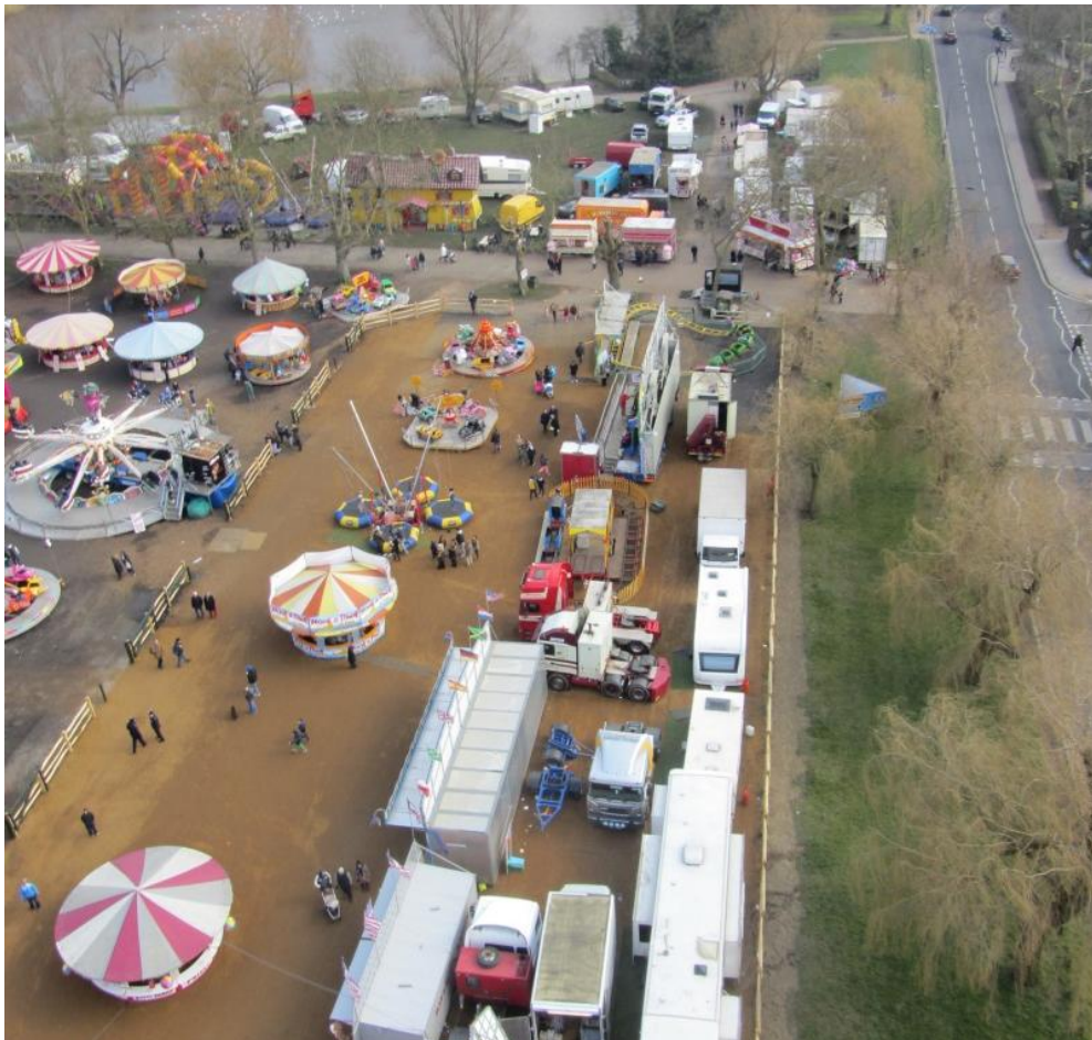
Figure 3: Photograph of the completed car park, looking east across the car park towards Hampstead No1 pond.