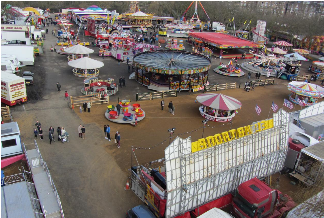
Figure 2: Photograph of the completed car park, looking north from the main entrance on East Heath Road (March 2013)