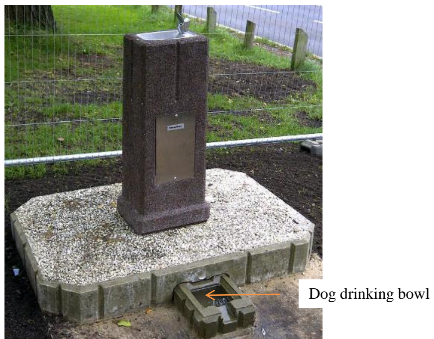
Figure 4: New water fountain at East Heath